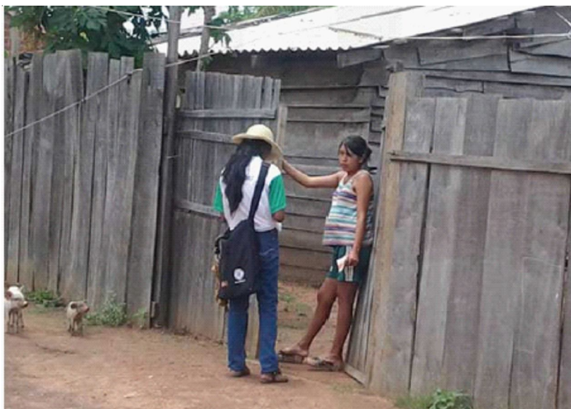
CBMS implementation in Concepcion, Bolivia.

Vulnerability is defined as the probability that a currently non-poor household falls into poverty or that an already poor household remains poor. The framework of the analysis is based on the social risk management approach (Morduch, 2001) and later adopted by the World Bank (Holzman et al., 2003), and the data comes from an innovate source based on the engagement of the community itself in the data collection process known as Community Based Monitoring System.